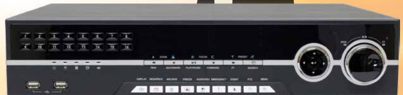
XVST MAGIC-08P XVST MAGIC-16P

PLUG BOTH ANALOG & HD-SDI CAMERAS IN ONE DVR IT JUST WORKS!!