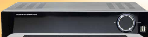
XVST MAGIC-04 XVST MAGIC-08